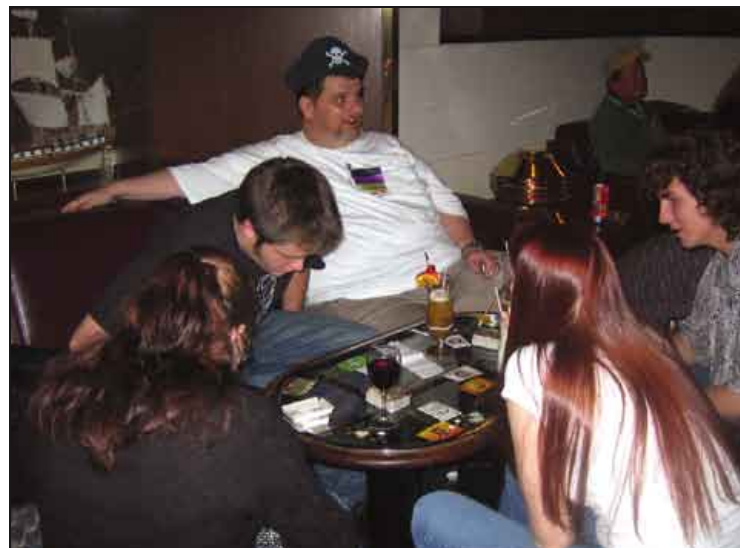
San Bernardino County LP Brings Youth and Spirit— The San Bernardino delegation out-attended and out-partied everyone else. Some even wore special t-shirts they designed for the cruise (above left). Gambling was legal in international waters, so there was a casino onboard, but one group had more fun with their own card games in the lounge.