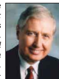
• Harry Browne 1933–2006

He was a strong advocate of the organization's Read the Bills Act , requiring Congress to read every word of every bill before voting on them.