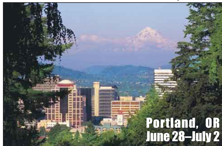
Portland, OR June 28–July 2

Anyone can be a Delegate, vote in Party Elections, business and be a part of the future of the LP. The California Delegation especially hopes you'll be there and help select national officers who make critical decisions on our direction.