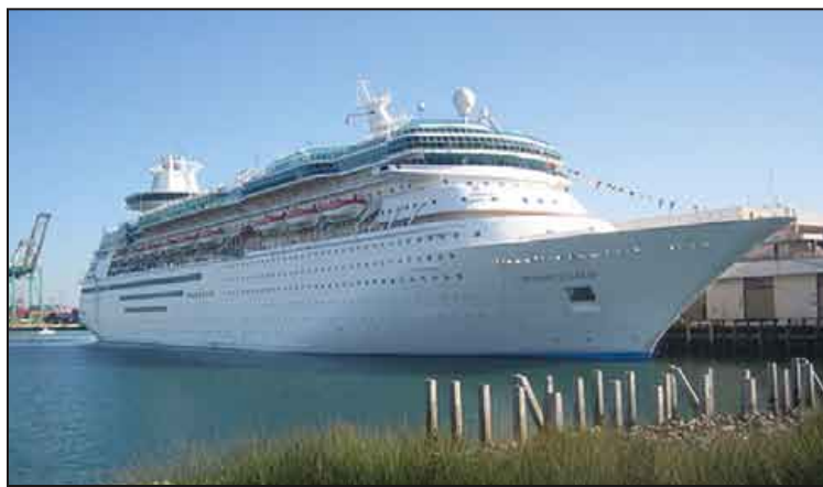
• Royal Caribbean's Monarch of the Seas provided a floating hotel for this year's state party convention.

This year's convention was held on Royal Caribbean's cruise liner, the Monarch of the Seas . We departed Los Angeles Friday afternoon, arriving Saturday at Ensenada, Mexico. Many went sightseeing that day, with several Committees working aboard. Convention business took place Sunday, while at sea.