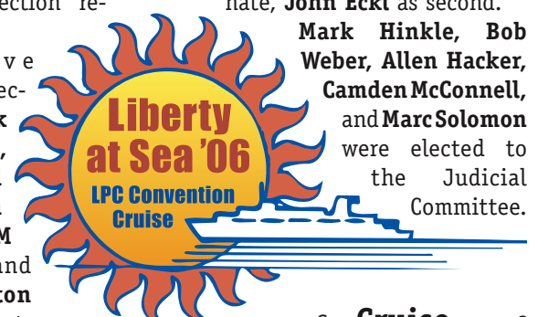
• See Cruise page 8