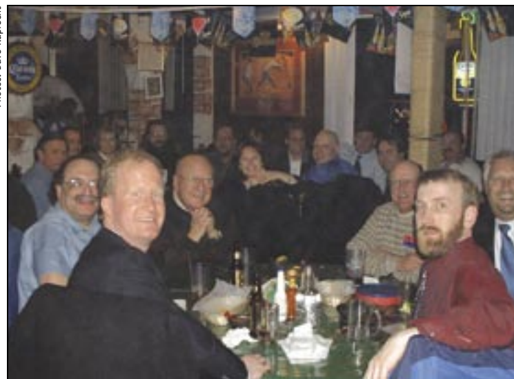
• State party executive directors develop camaraderie over Mexican food one evening during the conference.